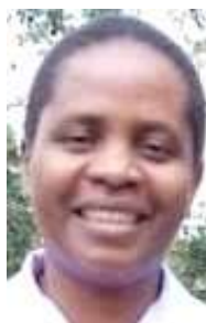
Hyline Raterno Kenya