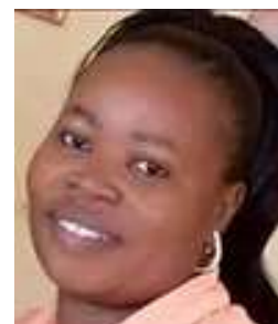
Nantap Dafur Nigeria