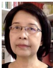
Rosa Ocampo Asia (Australia, India, New Zealand and the Philippines)