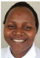
Marta Nyaga Africa (Kenya, Nigeria, Tanzania, Uganda and Zambia)